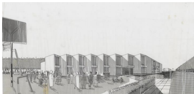
École Marie-Favery, Perspective